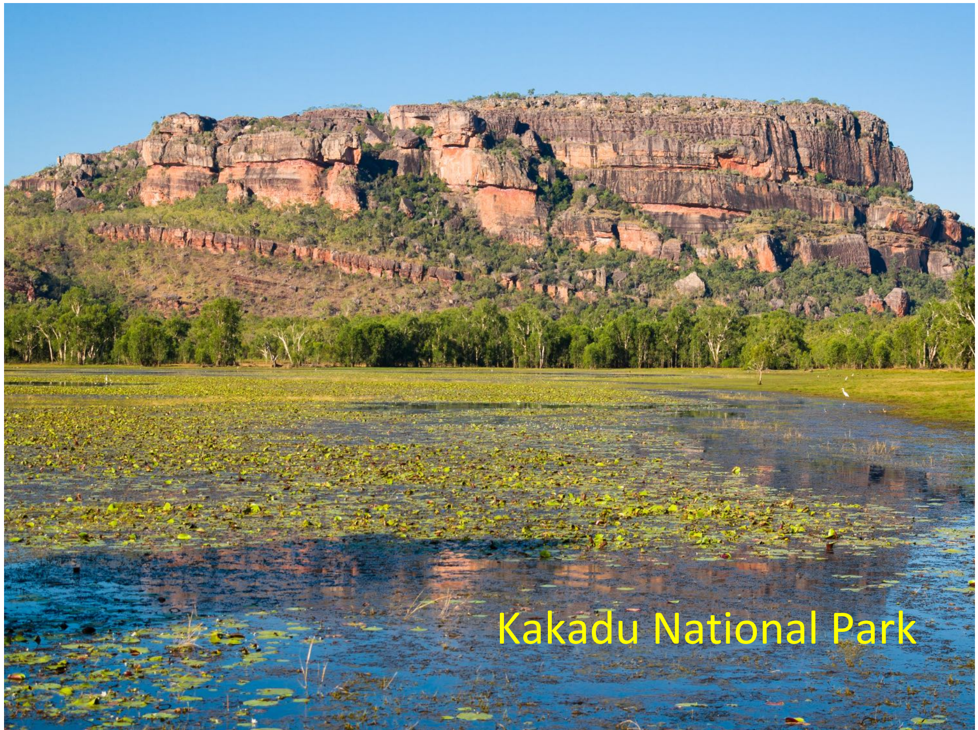
Kakadu National Park